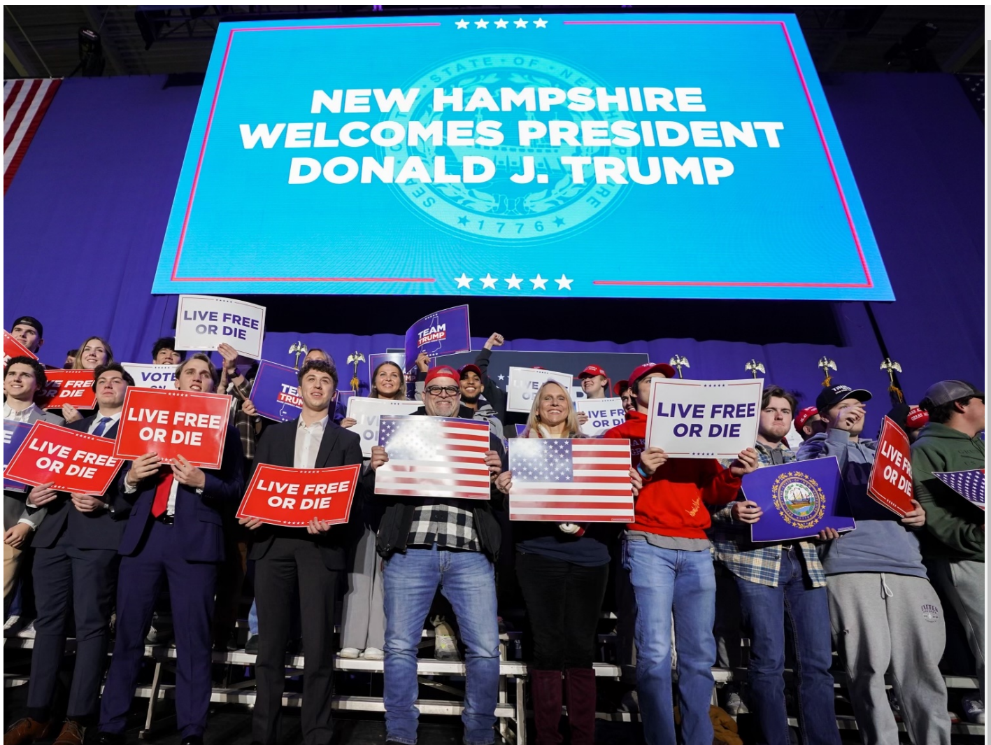
Trump supporters welcome their candidate at a Dec. 16 rally in New Hampshire.

Republican presidential candidate Donald Trump took aim at immigrants from around the world in a campaign speech delivered in New Hampshire.